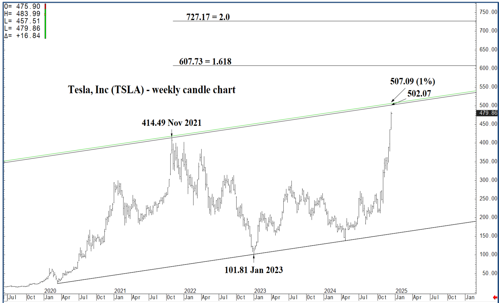
Tesla, Inc (TSLA) - weekly candle chart