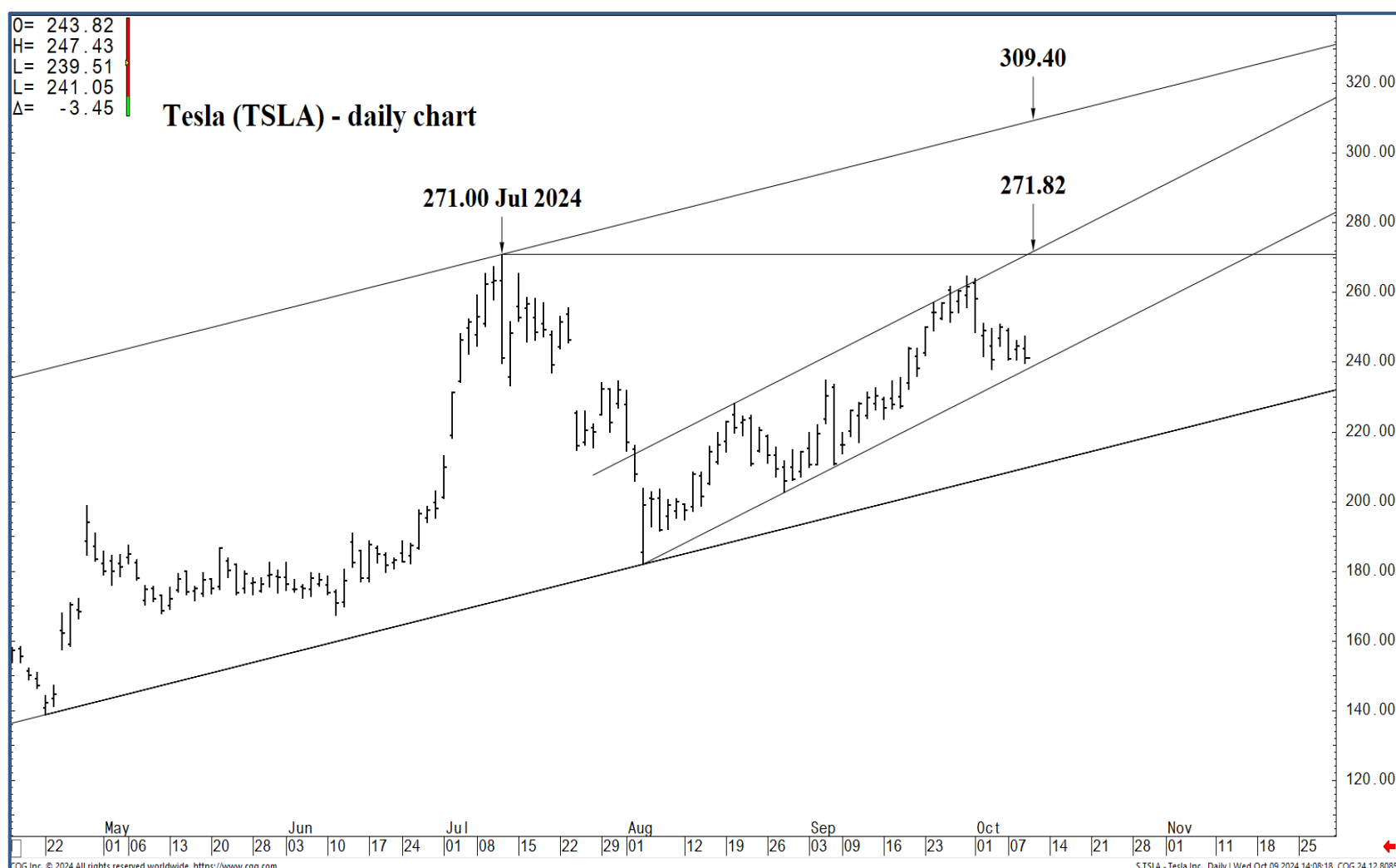
Tesla (TSLA) - daily chart

O= 243.82 H= 247.43 L= 239.51 L= 241.05 Δ= -3.45