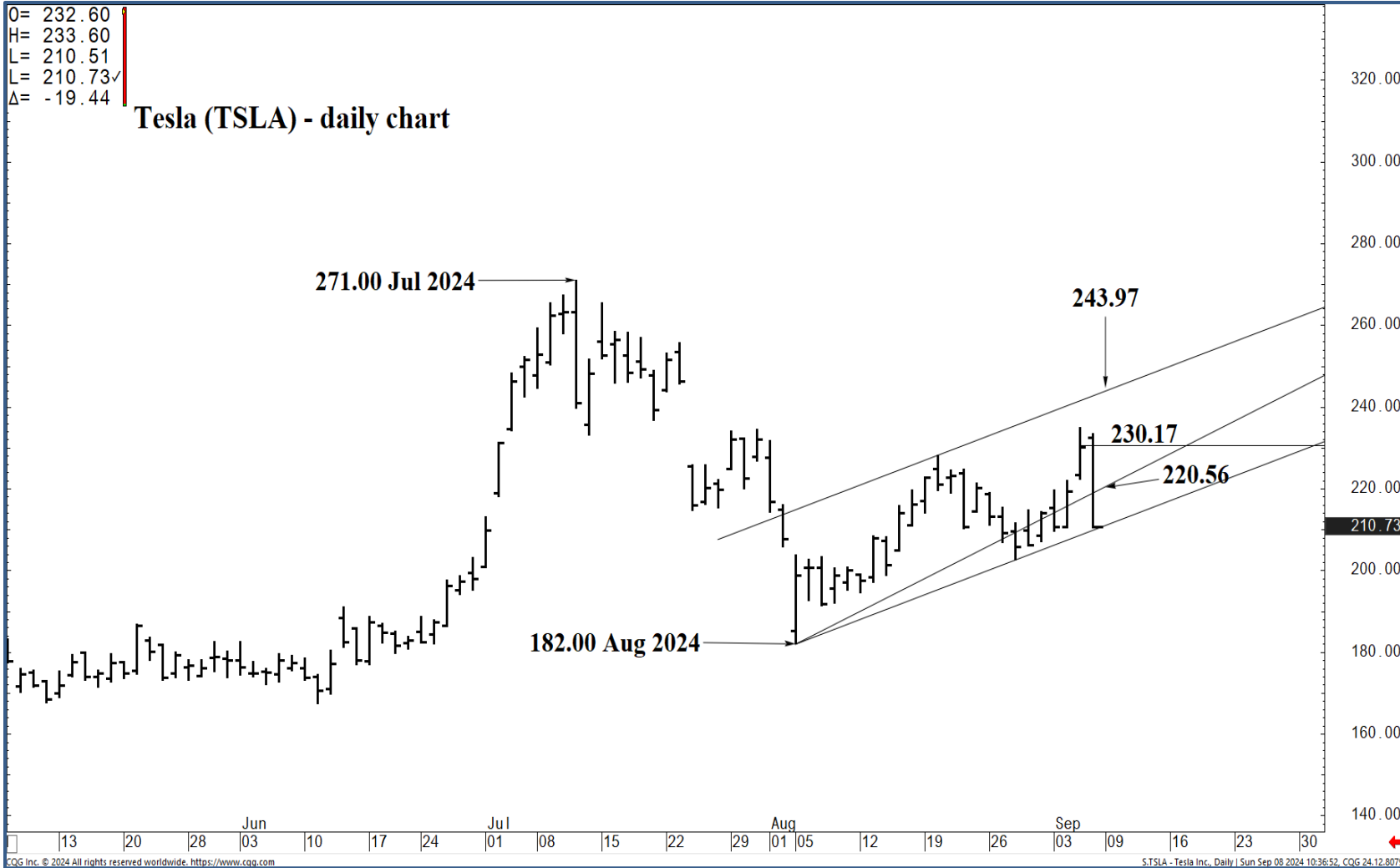
Tesla (TSLA) - daily chart

O= 232.60 H= 233.60 L= 210.51 L= 210.73✓ Δ= -19.44