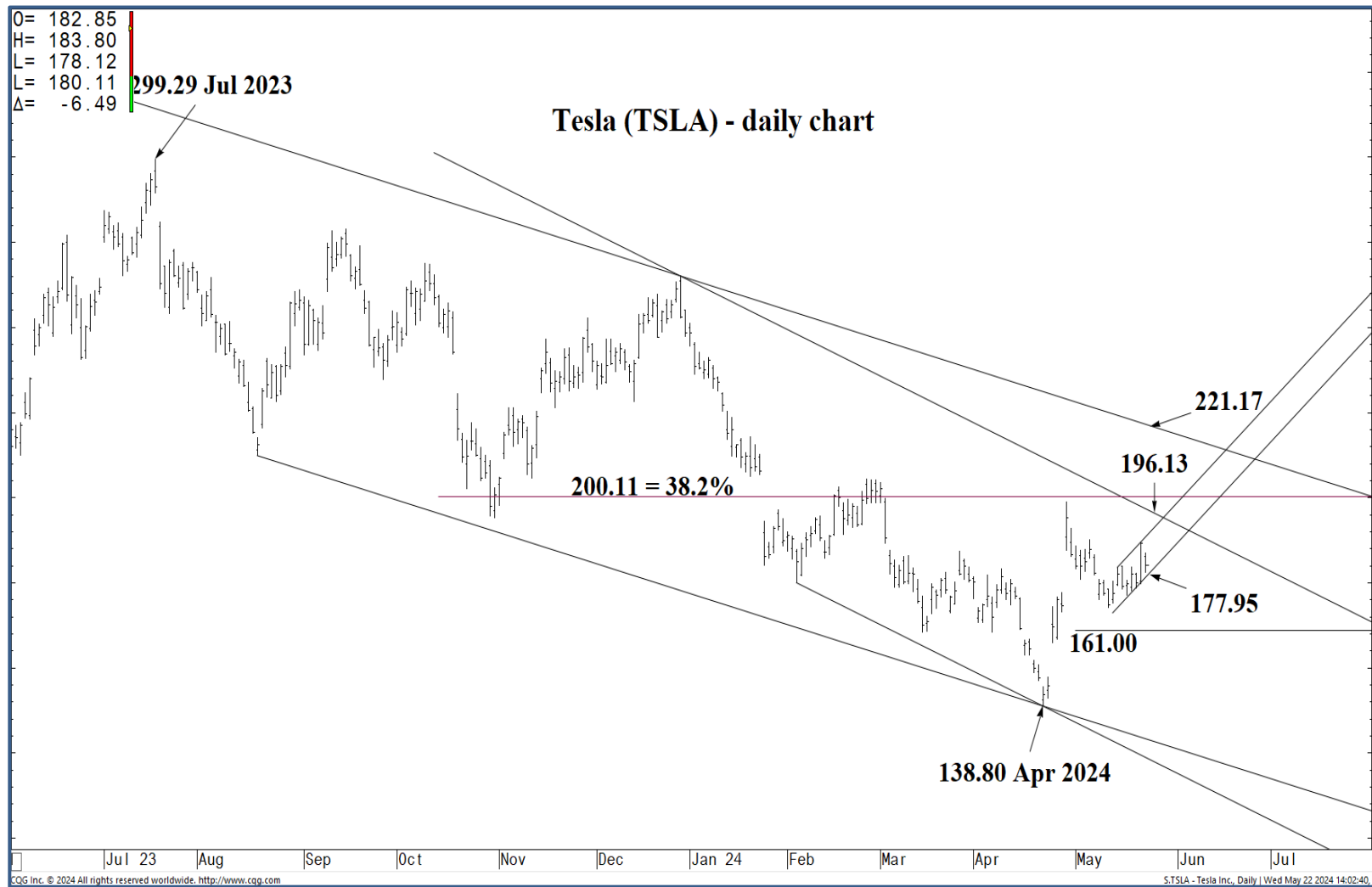
Tesla (TSLA) - daily chart