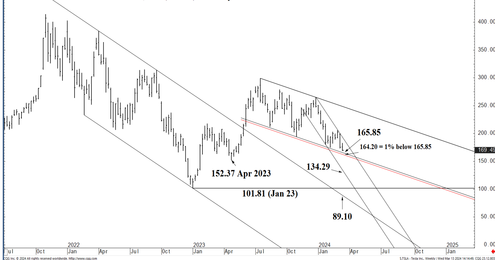
Tesla, Inc (TSLA) - weekly bar chart

O= 173.05 H= 176.05 L= 169.15 L= 169.49 Δ= -8.05