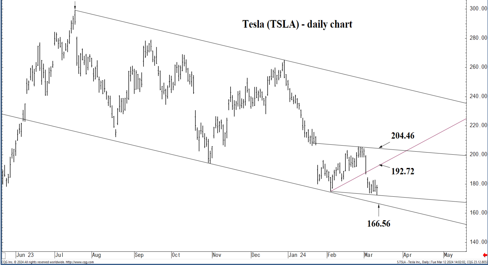
Tesla (TSLA) - daily chart