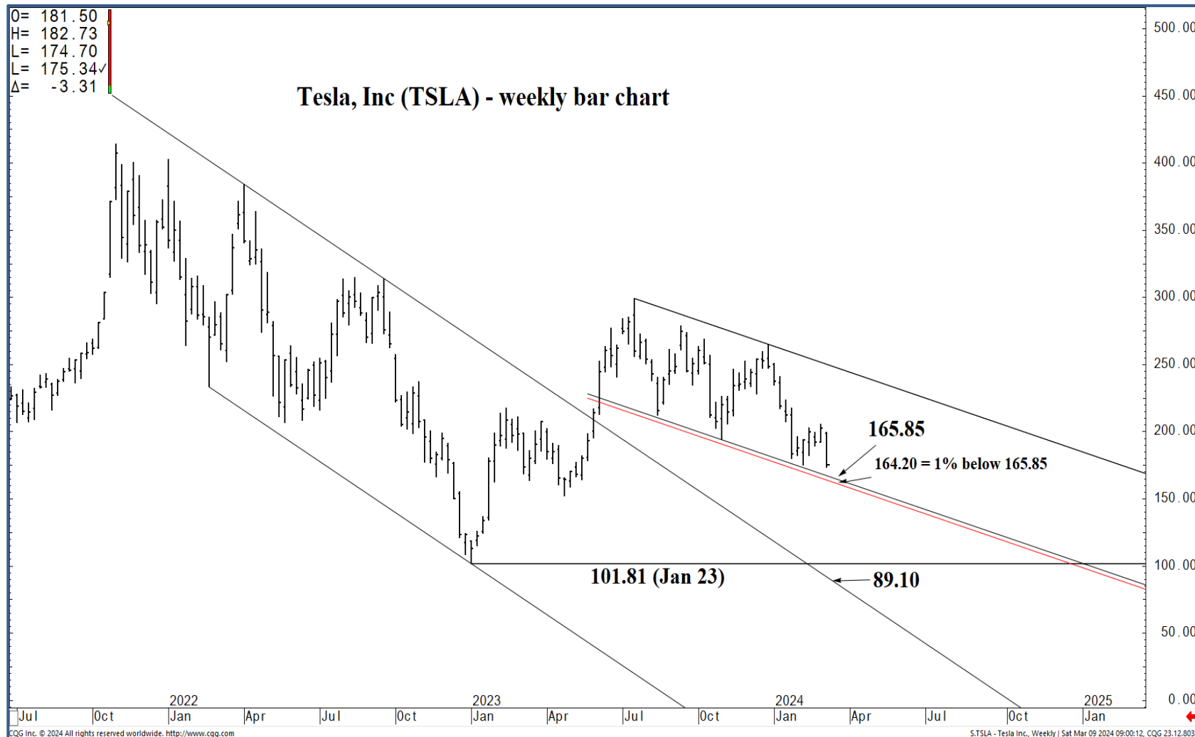
Tesla, Inc (TSLA) - weekly bar chart