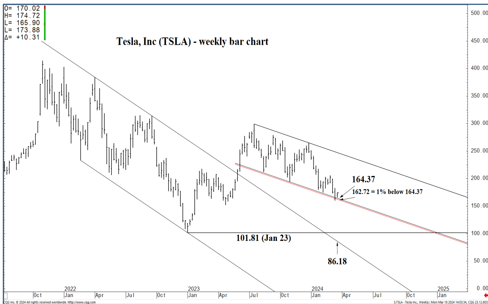
Tesla, Inc (TSLA) - weekly bar chart