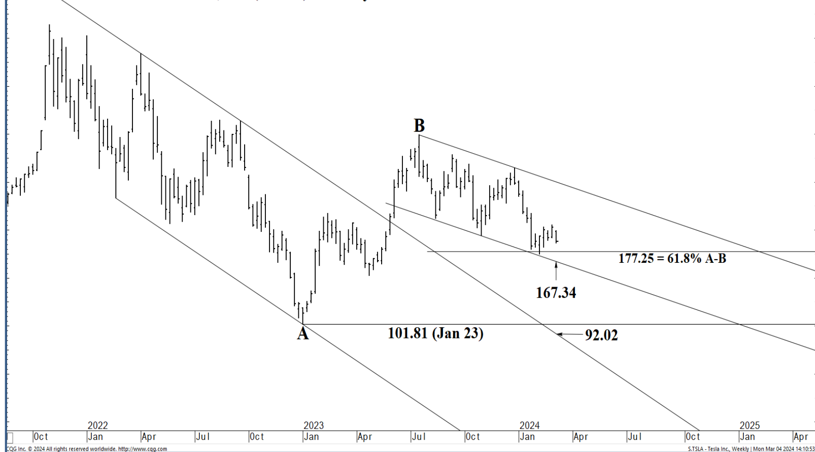
Tesla, Inc (TSLA) - weekly bar chart

O= 198.73 H= 199.75 L= 186.72 C= 188.14 Δ= -14.50