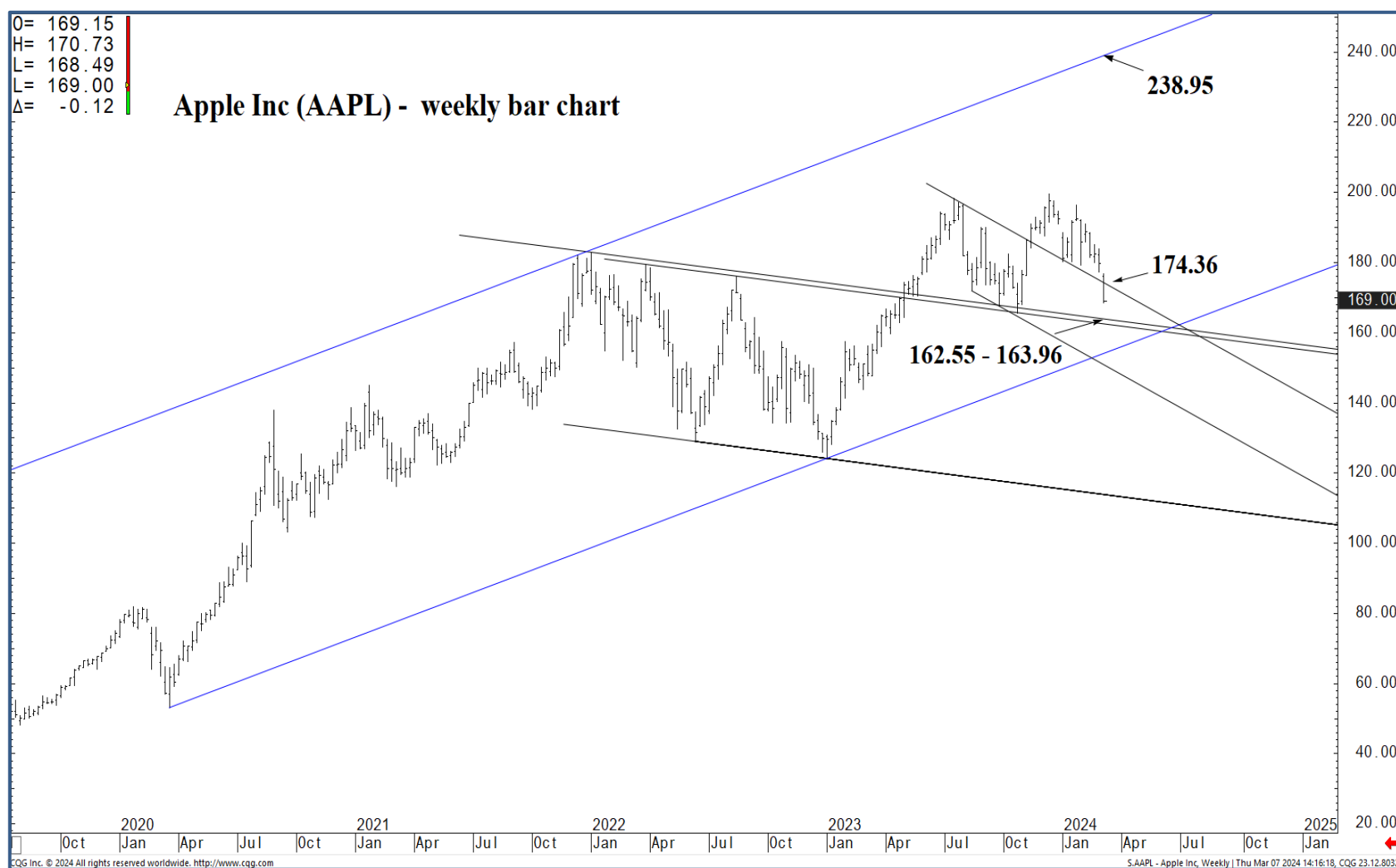
Apple Inc (AAPL) - weekly bar chart

O= 169.15 H= 170.73 L= 168.49 L= 169.00 Δ= -0.12