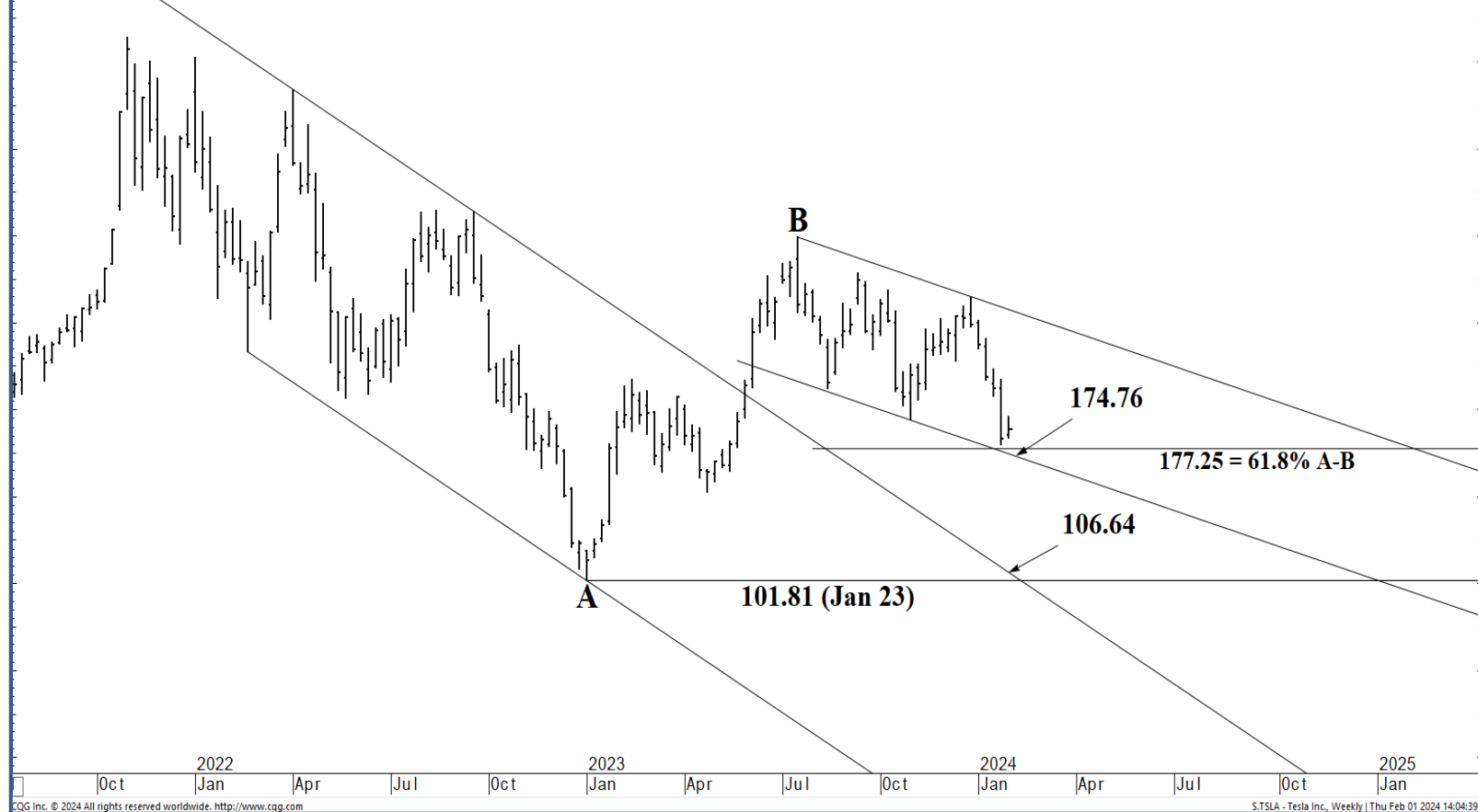
Tesla, Inc (TSLA) - weekly bar chart

500.00 450.00 400.00 350.00 300.00 250.00 200.00 150.00 100.00 50.00 0.00