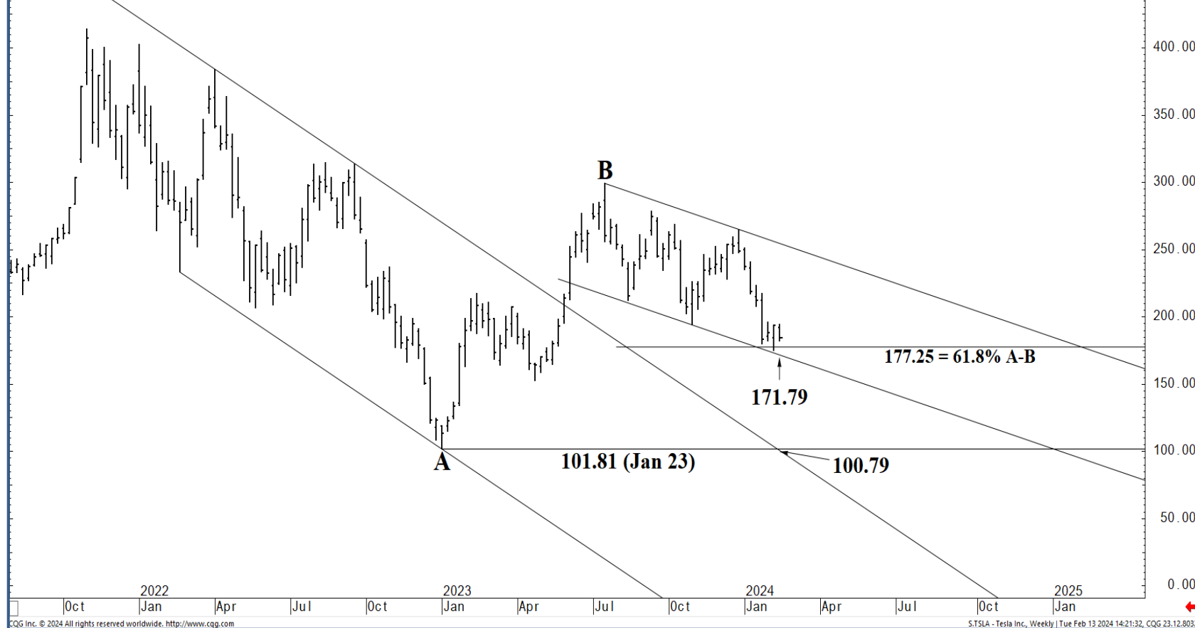
Tesla, Inc (TSLA) - weekly bar chart

O= 183.99 H= 187.26 L= 182.10 C= 184.02 Δ= -4.11