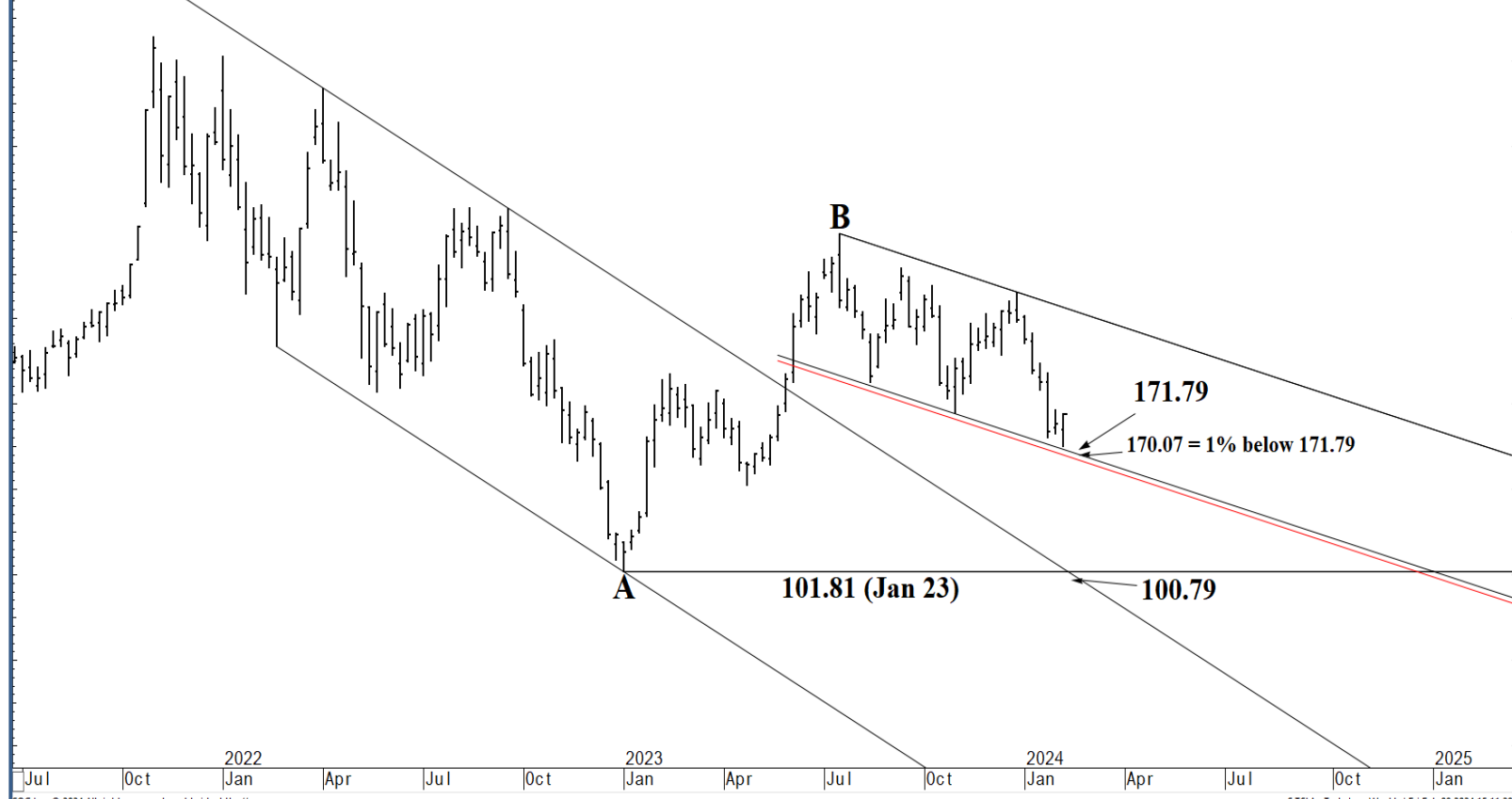
Tesla, Inc (TSLA) - weekly bar chart

O= 190.18 H= 194.12 L= 189.48 L= 193.57 Δ= +4.01