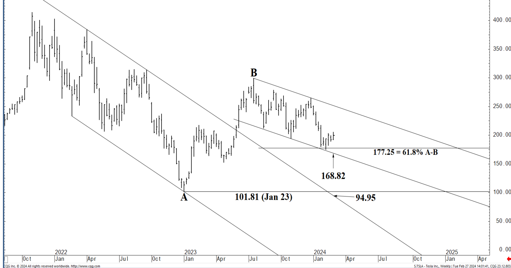
Tesla, Inc (TSLA) - weekly bar chart

O= 204.04 H= 205.60 L= 198.26 L= 199.73 Δ= +0.33