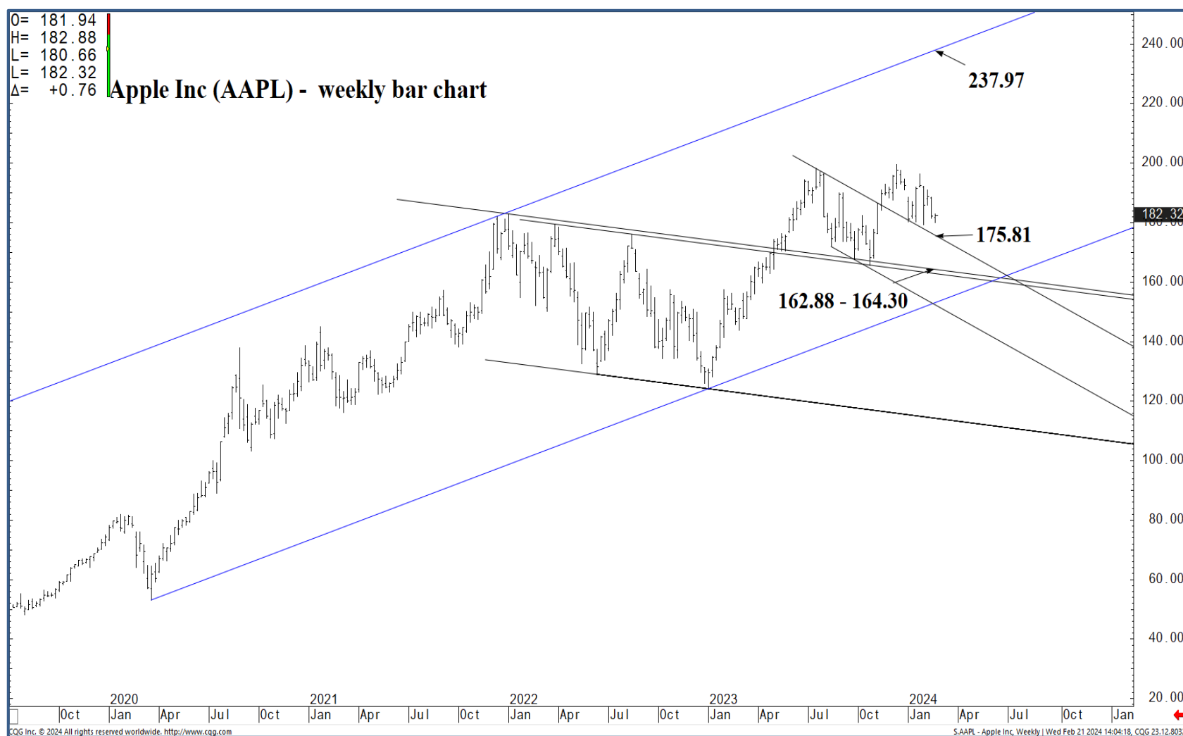
Apple Inc (AAPL) - weekly bar chart

O= 181.94 H= 182.88 L= 180.66 C= 182.32 Δ= +0.76