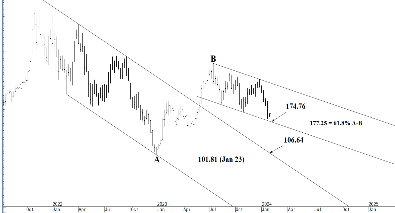
Tesla, Inc (TSLA) - weekly bar chart

O= 185.63 H= 191.48 L= 183.67 C= 190.93 Δ= +7.68