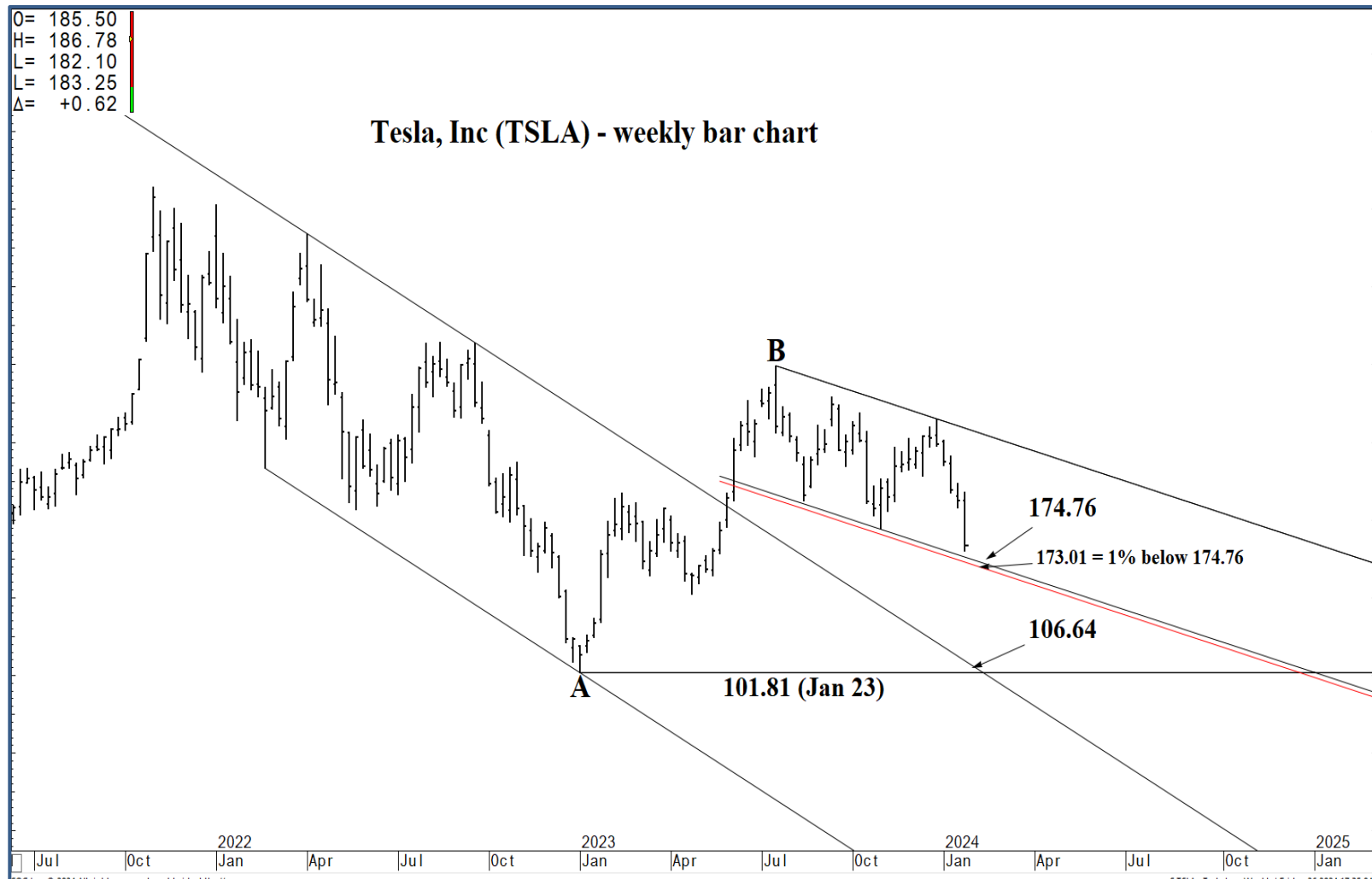
Tesla, Inc (TSLA) - weekly bar chart