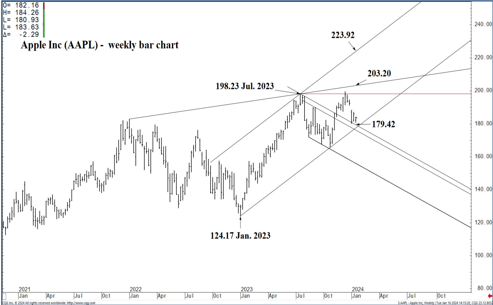
Apple Inc (AAPL) - weekly bar chart

O= 182.16 H= 184.26 L= 180.93 L= 183.63 Δ= -2.29